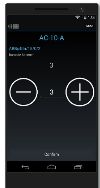
Put Away Stock