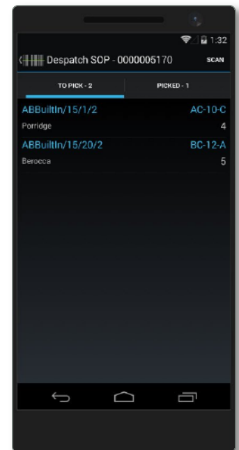
Pick and Despatching Sales Orders